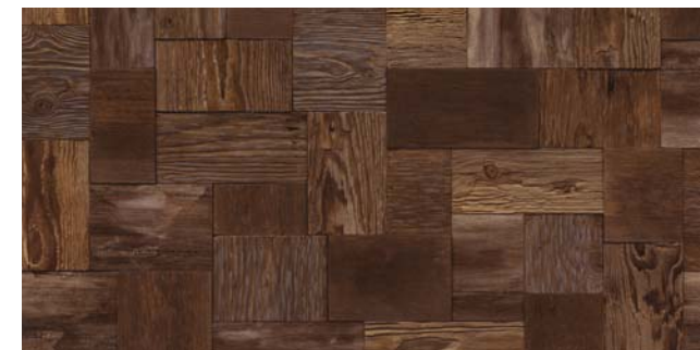
113021 Block Cedar