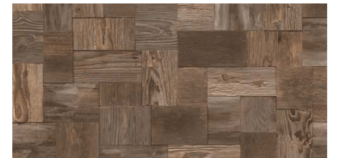
113022 Block Olive